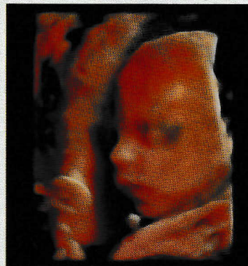
4D Live Imaging at 27 Weeks